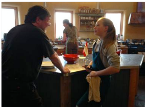
Contemplating the Camino